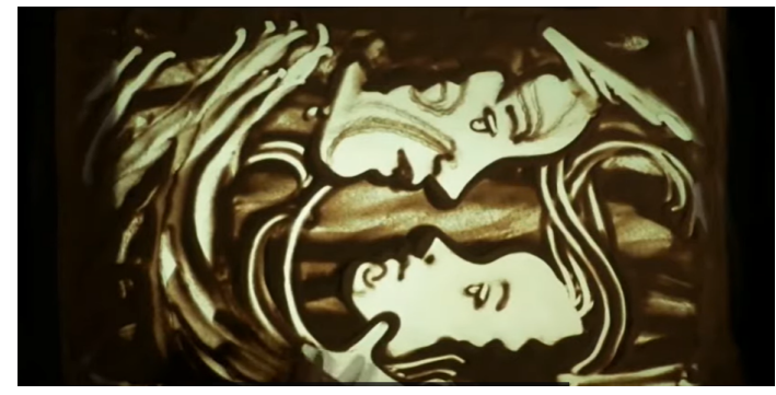
1.Papatuanuku (Earth Mother) Ranginui (Sky Father) and how the heavens and earth were created. In the beginning lived the earth mother. And the sky father, they dewlt together in each other's embrace

2. In between them lived their children but their children lived in darkness. They had to crawl between narrow spaces between the parents, so they had never seen the light, neither had they stood.